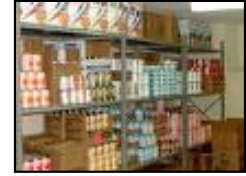
The Hurricane Stockpile

The Million Meals Committee will conduct a radio campaign entitled "The Hurricane Stockpile" in partnership with the COX radio network (99 Jamz, Hot 105, Coast 97.3, and 93 Rock). Through on air promotional announcements, monthly email newsletters, the excitement of their weekend remote locations and website exposure for eight weeks, starting on June 1st, COX radio station will ask their audience to buy something extra for someone less fortunate than they are when they are purchasing their own hurricane supplies.