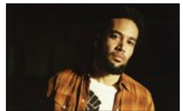
Ben Harper brings his band, the Innocent Criminals, to the Gusman on Oct. 31.

November 16 - Rhythm Foundation presents Youssou N'Dour , the Senegalese singer and percussionist who is one of the most celebrated African musicians in history. His music mixes the traditional styles of his country with samba, hip hop, jazz and soul influences. Named one of the Time 100 in 2007, he has pioneered campaigns to fight malaria and improve the spread of technology in Africa.