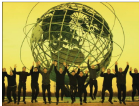
Spanish Harlem Orchestra

businesses, state of Florida agencies, local governments, and the community at large - all working together to find countywide solutions to traffic congestion in our community.