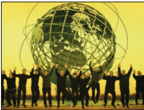
Spanish Harlem Orchestra